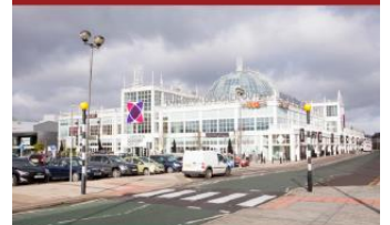
Livingston Designer Outlet