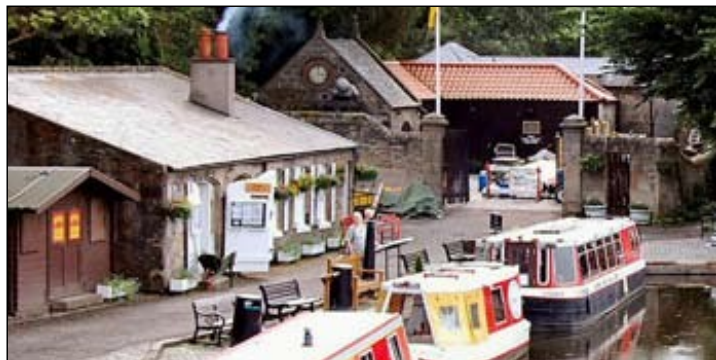
Linlithgow Canal Centre - Canal Museum, Tearoom and Boat Trips

Web: www.lucs.org.uk (Tel: 01506-671215)