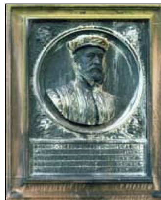
Plaque commemorating the Earl of Moray's assassination

Further along the High Street is the Courthouse of 1863, built in Tudor style. On its front is a bronze relief commemorating the assassination of Regent Moray in the vicinity in 1570. This was the world's first recorded assassination of a head of state by firearm.