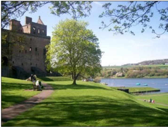
Linlithgow Palace, Peel and Loch

The Scottish Parliament met in the Great Hall on several occasions, most recently in 1646. The Palace was fortified and occupied during 1650–59 by Oliver Cromwell, had its well flowing with wine for Bonnie Prince Charlie in 1745, was gutted by fire in 1746 after occupation by the Duke of Cumberland's soldiers and has remained roofless ever since. The property is in the care of Historic Scotland. Guide book available.