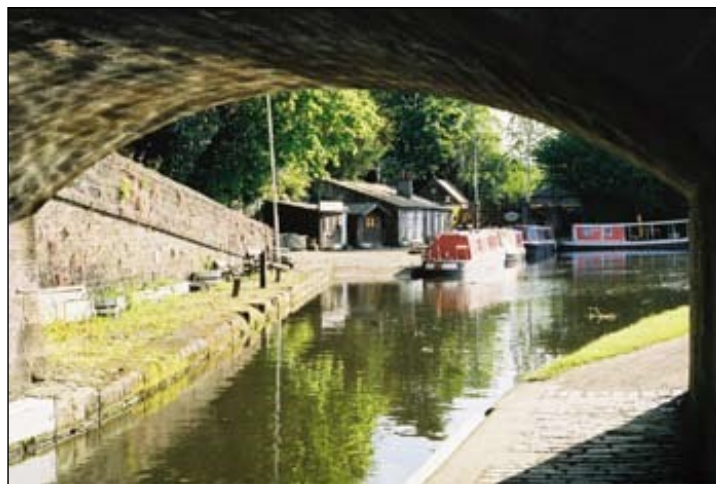
Union Canal Basin

Here is the Linlithgow basin of the Union Canal, opened in May 1822, closed in 1965, and restored to its former glory by the Lottery-funded Millennium Link project. Visit the Canal Museum and Tearoom, once the stables, or take a boat trip organised by the very active Linlithgow Union Canal Society.