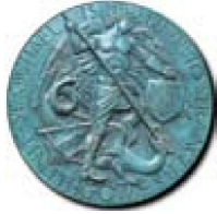
St. Michael is Kinde to Strangers

You can split the walk into easy sections.