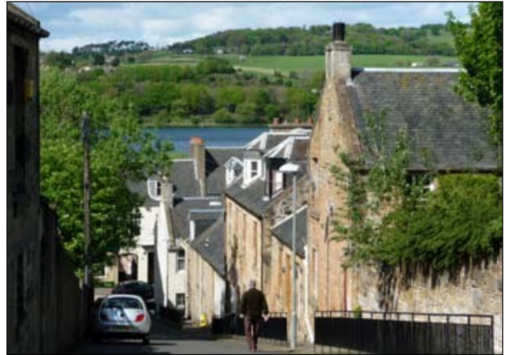
Lion Well Wynd

The church on the right was completed in 1840 as a congregational chapel, at a cost of around £750.