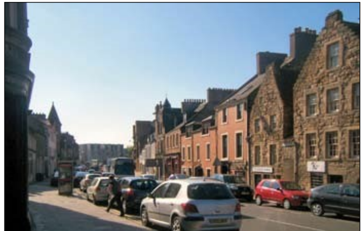
High Street with Hamilton's Land at extreme right

Further along on the left, these rubble built 16th-century buildings, with their crow-stepped gables facing the street, are a picturesque survival of old Linlithgow that was restored by The National Trust for Scotland in 1958.