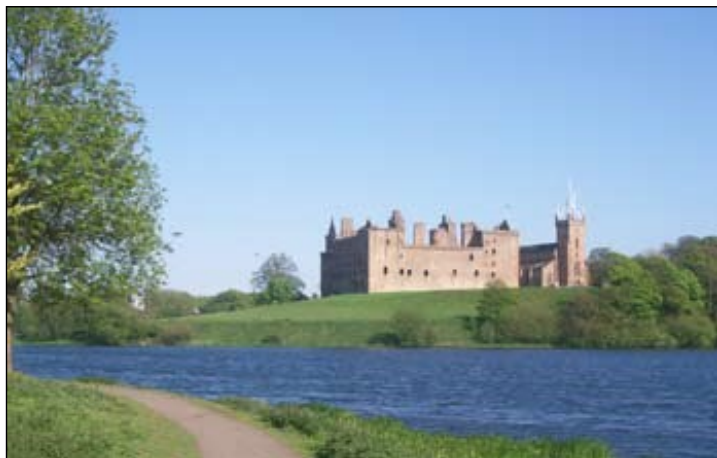
Linlithgow Palace and St Michael's Parish Church viewed from the footpath around Linlithgow Loch