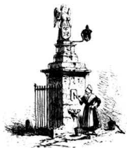
St Michael's Well

Also on the opposite side of the High Street is the wellhead of St Michael's Well (sketch on right). A plinth, now devoid of its waterspout, supports an inscribed stone dated 1720, topped with a winged figure of St Michael and the town's 'Black Bitch' coat-of-arms. Restored in 2010.